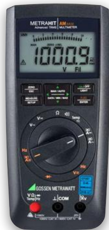
METRAHIT AM BASE

Safe and Reliable Multimeters for Diverse Applications