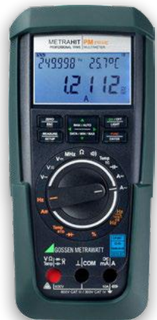
METRAHIT PM PRIME