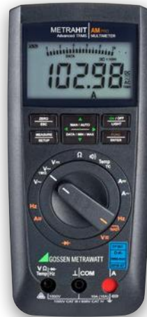
METRAHIT AM PRO