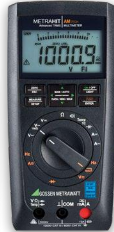
METRAHIT AM TECH