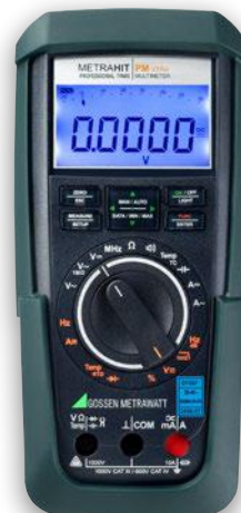
METRAHIT PM XTRA