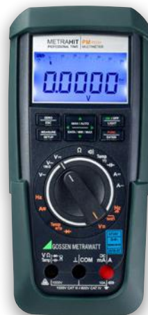
METRAHIT PM TECH