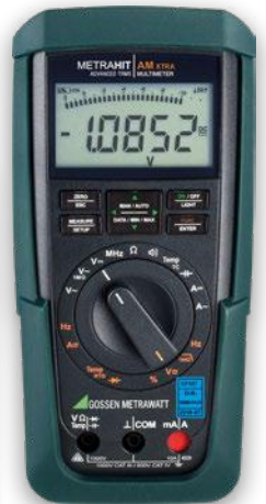
METRAHIT AM XTRA